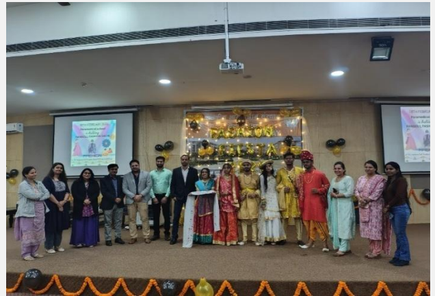
Uttar Pradesh Diwas - 13/02/2025